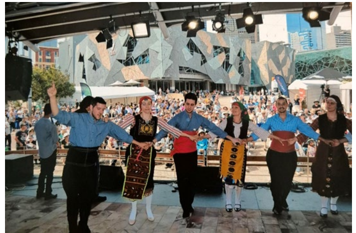
Greek dancers at the Festival celebrating the 30 th Anniversary of the Melbourne/Thessaloniki sister city relationship at Federation Square

The Thessaloniki Association has always supported these initiatives and has been keen to find new ways to re-vitalize awareness of the link between Thessaloniki and Melbourne.