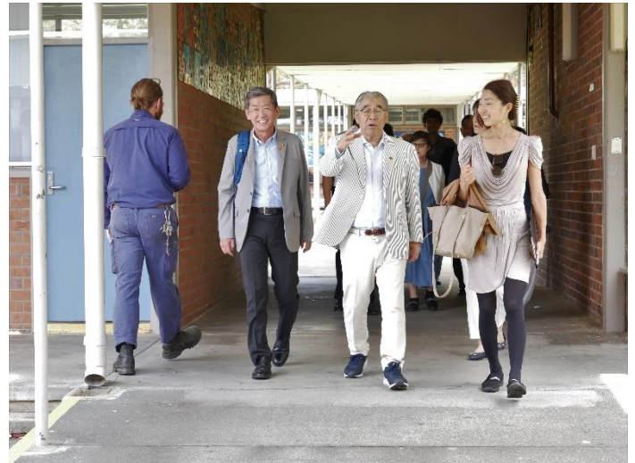
The City of Moka Delegation tours Harvey Senior High School.