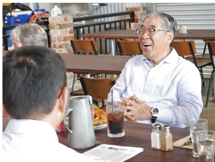
City of Moka Mayor Shinichi Ishizaka enjoying lunch at Brugan Brewery.

The Shire of Harvey provided delegates with Welcome Packs that included information on the significance of Welcome to Country and local Aboriginal customs. Students and officials engaged positively with Elders after these ceremonies to learn more.