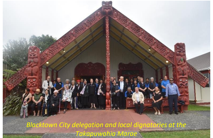
Blacktown City delegation and local dignitaries at the Takapuwahia Marae

This was Blacktown City Council's first delegation since 2019 with Covid causing international travel disruption. However the relationship between our cities is firmly back