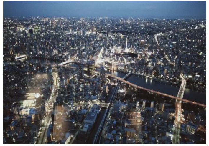
Figure 3 - The Sumida River from Tokyo skytree.

government place on the agreement between the cities.