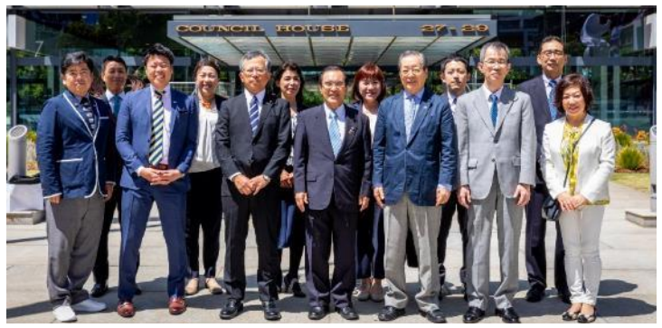
Figure 1 - Kagoshima delegation at Council House

The City of Perth recently welcomed a delegation of government, academic and business representatives from Kagoshima, Japan to celebrate the 45th Anniversary of our Sister City relationship.