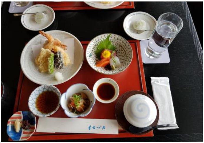
Figure 1 - Traditional Japanese lunch

The City of Belmont has built a 35 year relationship with its Sister City, Adachi-ku in Tokyo, Japan, having entered into a Sister City relationship in October of 1984. The mainstay of this relationship since its inception has been the annual Student Exchange Program, which promotes cultural, educational and economic exchanges between the two cities. Each year City of Belmont students travel to Adachi in early January to experience Japanese culture and customs. Similarly, students from Adachi-ku visit the City of Belmont in July-August where they explore the City and the wider Perth region, participating in cultural tours, school visits and sightseeing. Every five years a Citizens Delegation replaces the student delegation with the purpose of re-affirming the agreement between the two cities. On the 15 January 2020, selected delegates from Belmont flew to Adachi with the celebrating purpose the long-standing relationship and re-affirming each commitment to work harmoniously together.