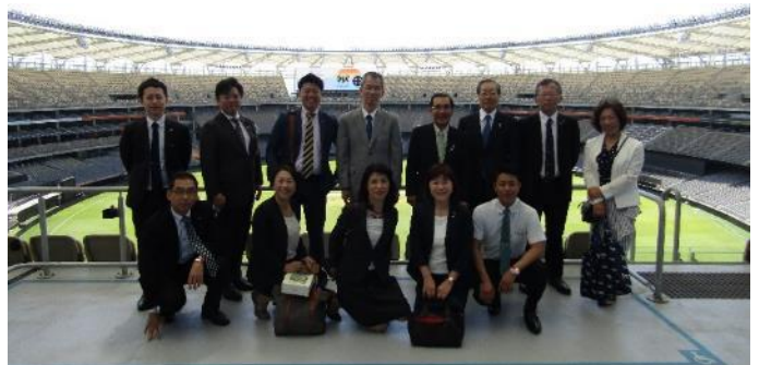
Figure 2 - Delegation visiting the iconic Optus Stadium noodle market.

field of Optus Stadium, enjoyed a behind the scenes tour of the new Western Australian Museum, attended a business breakfast facilitated by Asialink Business and tasted udon noodle varieties from a Western Australian business who are the benchmark worldwide in the Japanese udon