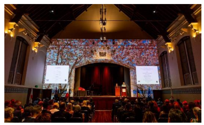
Figure 3 – Civic Welcome Reception at the Perth Town Hall

tree planting ceremony and the Civic Welcome Reception the evening prior. Over 200 people joined to commemorate the anniversary of our relationship and share fond memories at a Civic Welcome Reception hosted at the Perth Town Hall. The Perth Town Hall was decorated with flags, a cherry blossom display and a beautiful feature at the entrance from the Perth Kimono Club, including a wedding kimono.