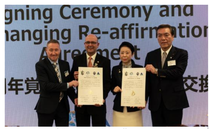
Figure 2 - Successfully executing the re-affirmation agreement

The 35th year Citizens Delegation successfully reaffirmed the City of Belmont's commitment with Adachi-ku, with a focus on working collaboratively together to achieve positive youth, educational, cultural and business opportunities. These opportunities activate economic, social, educational and cultural outcomes. The 2020 Sister City Citizens delegation ran from Wednesday 15 January – Friday 24 January 2020. A total of 22