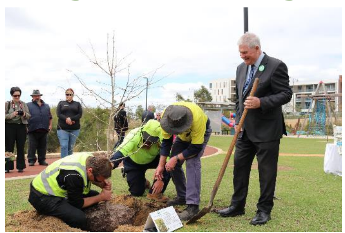
Six-year-old Ginkgo biloba saplings will be planted in their new home as the City of Cockburn hosts its first United Nations International Day of Peace event on 21 September.

The trees, raised from a seed harvested from a Ginkgo biloba that survived the WW2 bombing of Hiroshima 75 years ago, will be planted by Cockburn Mayor Logan Howlett, at a public event attended by local school students at Yandi Park, Cockburn Central at 2pm.