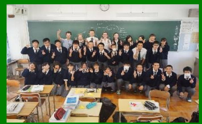
something that none of us will ever forget and reinforced to us the need for friendships to unite the world and peace.

the lifelong struggles war especially the Atomic Bomb has caused. It gave a real feeling to what we have learnt in History at school in Australia. Close to the museum there is the Peace Memorial dedicated to the children effected by the war. People who visit from all over the world make paper cranes a symbol of peace and leave them there. Our goal was to make 200 paper cranes we ended up making just over 250 paper cranes which we left at the memorial. While at Hiroshima we walked through the peace park and also A dome where the Atomic bomb exploded. Hiroshima was