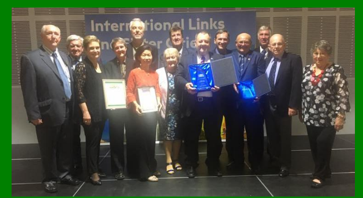
Congratulations to the winners, all pictured above with the SCA Executive

WINNER – Cairns, for their Economic Delegation to Zhanjiang, China, 12-18 December 2017